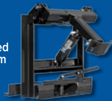
DROP PIN, MANUAL TILT HITCH