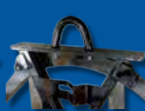
DROP PIN A-FRAME