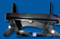
SWIVEL ADAPTER DROP PIN, MANUAL TILT HITCH